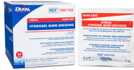
Burn Gel Dressings