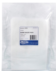
Burn Gauze Pads