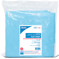
Disposable Fitted Sheet

> To learn more, click a category or visit our website